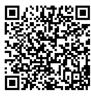
Scan for a full overview of our CIS-31XX Talk Back system