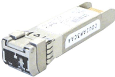
Figure 1. Cisco 10GBASE SFP+ Modules

The Cisco® 10GBASE SFP+ modules (Figure 1) give you a wide variety of 10 Gigabit Ethernet connectivity options for data center, enterprise wiring closet, and service provider transport applications.