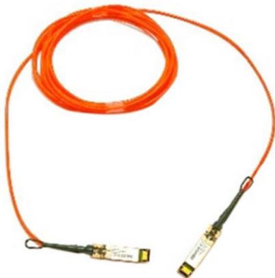
Figure 4. Cisco Direct-Attach Active Optical Cables with SFP+ Connectors