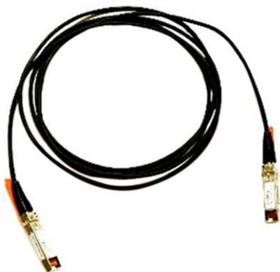
Figure 3. Cisco Direct-Attach Twinax Copper Cable Assembly with SFP+ Connectors

Cisco SFP+ Copper Twinax (Figure 3) direct-attach cables are suitable for very short distances and offer a cost-effective way to connect within racks and across adjacent racks. Cisco offers passive Twinax cables in lengths of 1, 1.5, 2, 2.5, 3 and 5 meters, and active Twinax cables in lengths of 7 and 10 meters.