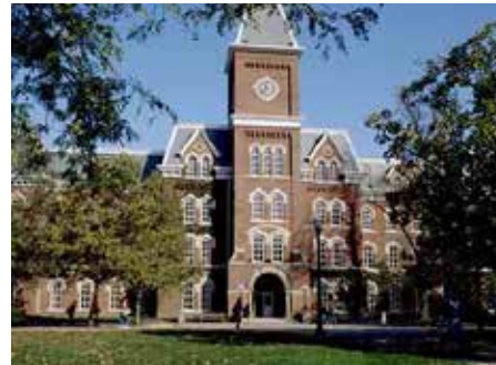
OHIO STATE UNIVERSITY Columbus, OHIO