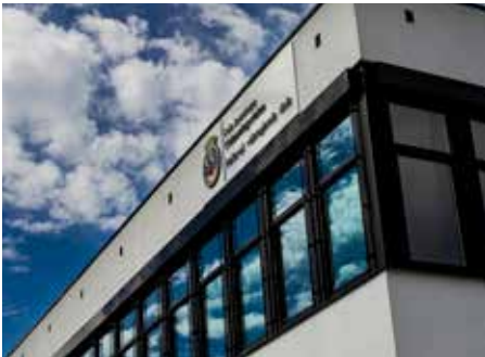
OSLO SCHOOLS Oslo, Norway