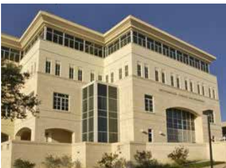
UNIVERSITY OF TEXAS At San Antonio San Antonio, Texas