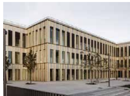
HEC PARIS Business School, France