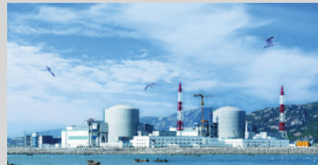
TIANWAN & QINSHAN NUCLEAR POWER STATIONS CHINA

Visit us online at zenitel.com for more information about our references and Vingtor-Stentofon Industry projects.