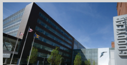
GOODYEAR TIRE & RUBBER PLANT TOPEKA, KANSAS, USA